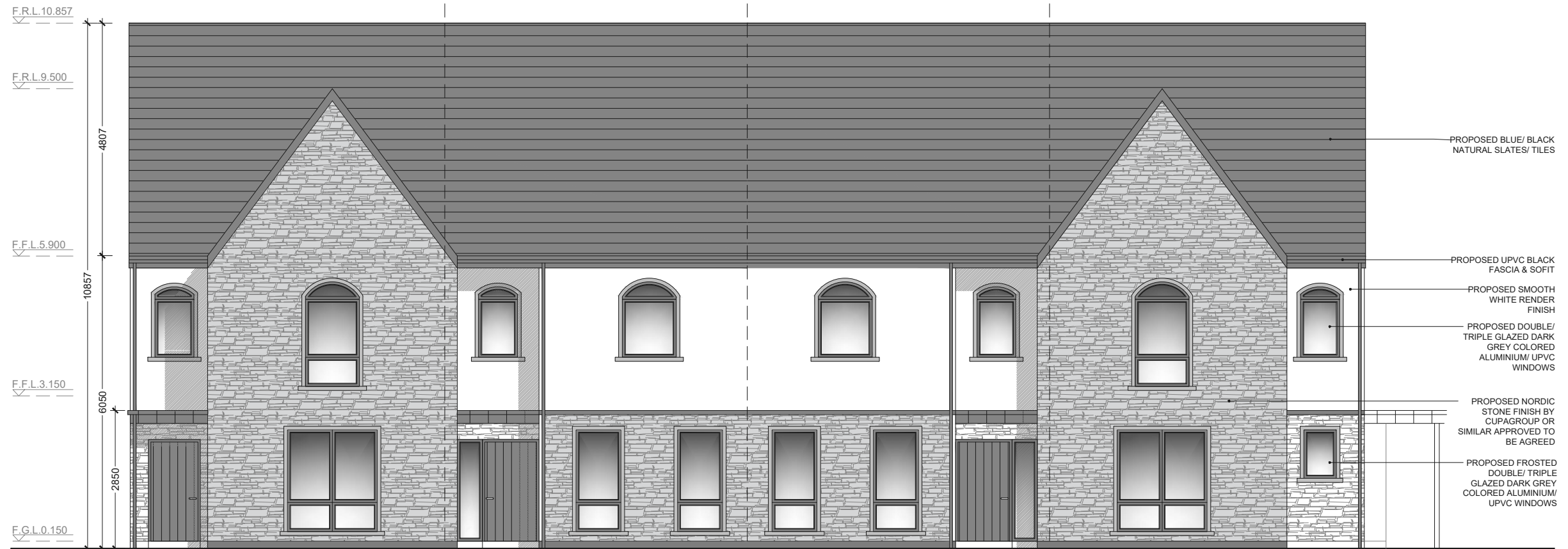
TYPE E2 - PROPOSED 3 + 4 BED TERRACED - FRONT ELEVATION - SCALE 1:100