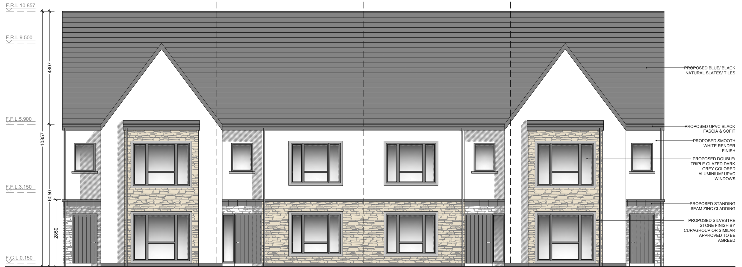
TYPE E1 - PROPOSED 3 + 4 BED TERRACED - FRONT ELEVATION - SCALE 1:100