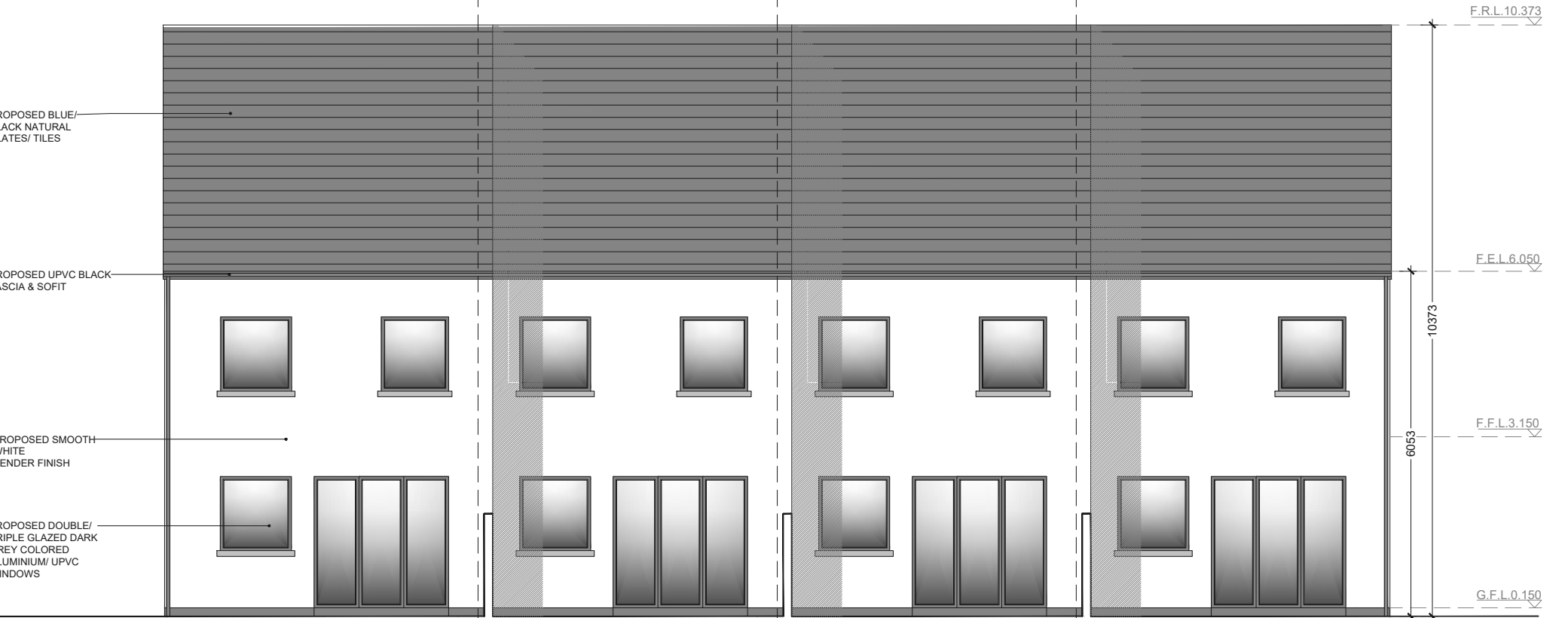
TYPE D4 - PROPOSED 3 BED TERRACED REAR ELEVATION - SCALE 1:100