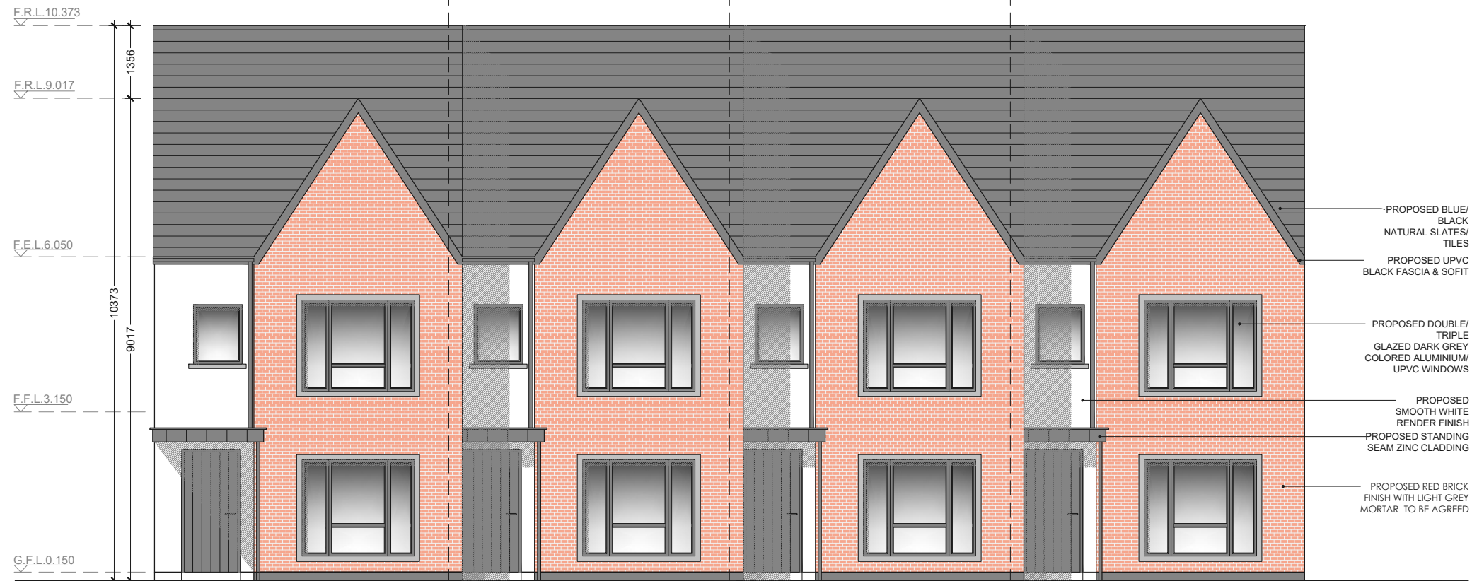
TYPE D4 - PROPOSED 3 BED TERRACED FRONT ELEVATION - SCALE 1:100