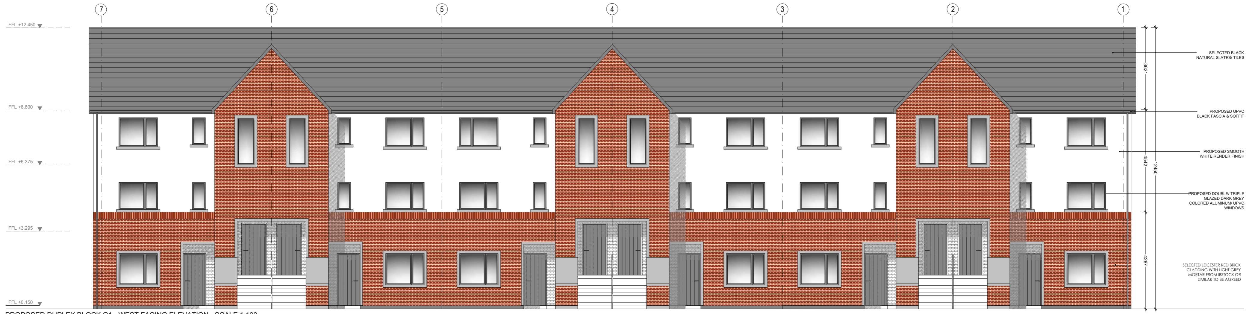
PROPOSED DUPLEX BLOCK G1 - WEST FACING ELEVATION - SCALE 1:100