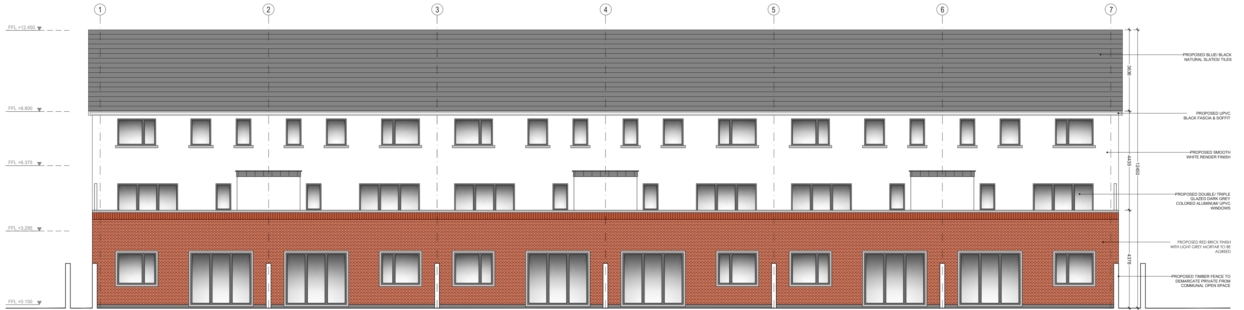
PROPOSED DUPLEX BLOCK G1 - EAST FACING ELEVATION - SCALE 1:100

NOTE: LOCATION OF PV PANELS SUBJECT TO HOUSE ORIENTATION ON SITE.