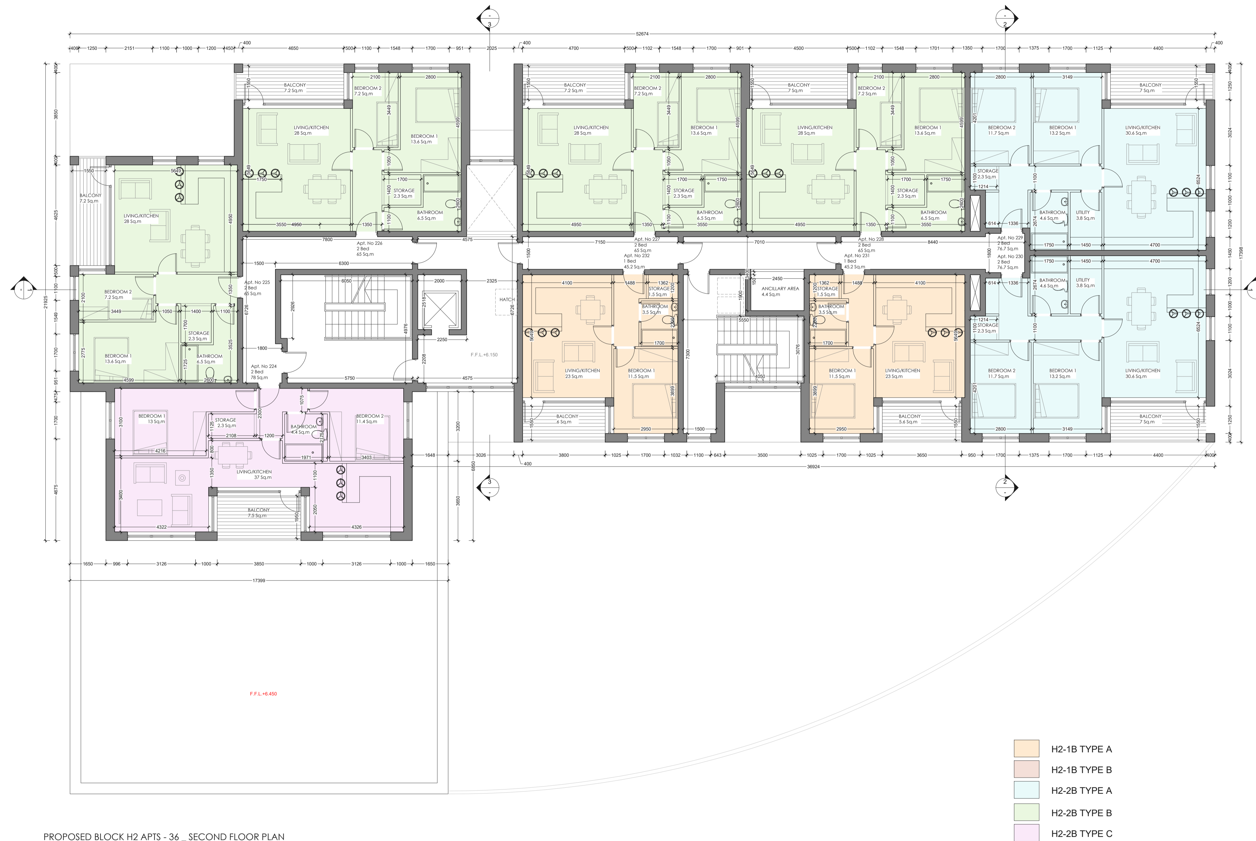
PROPOSED BLOCK H2 APTS - 36 _ SECOND FLOOR PLAN