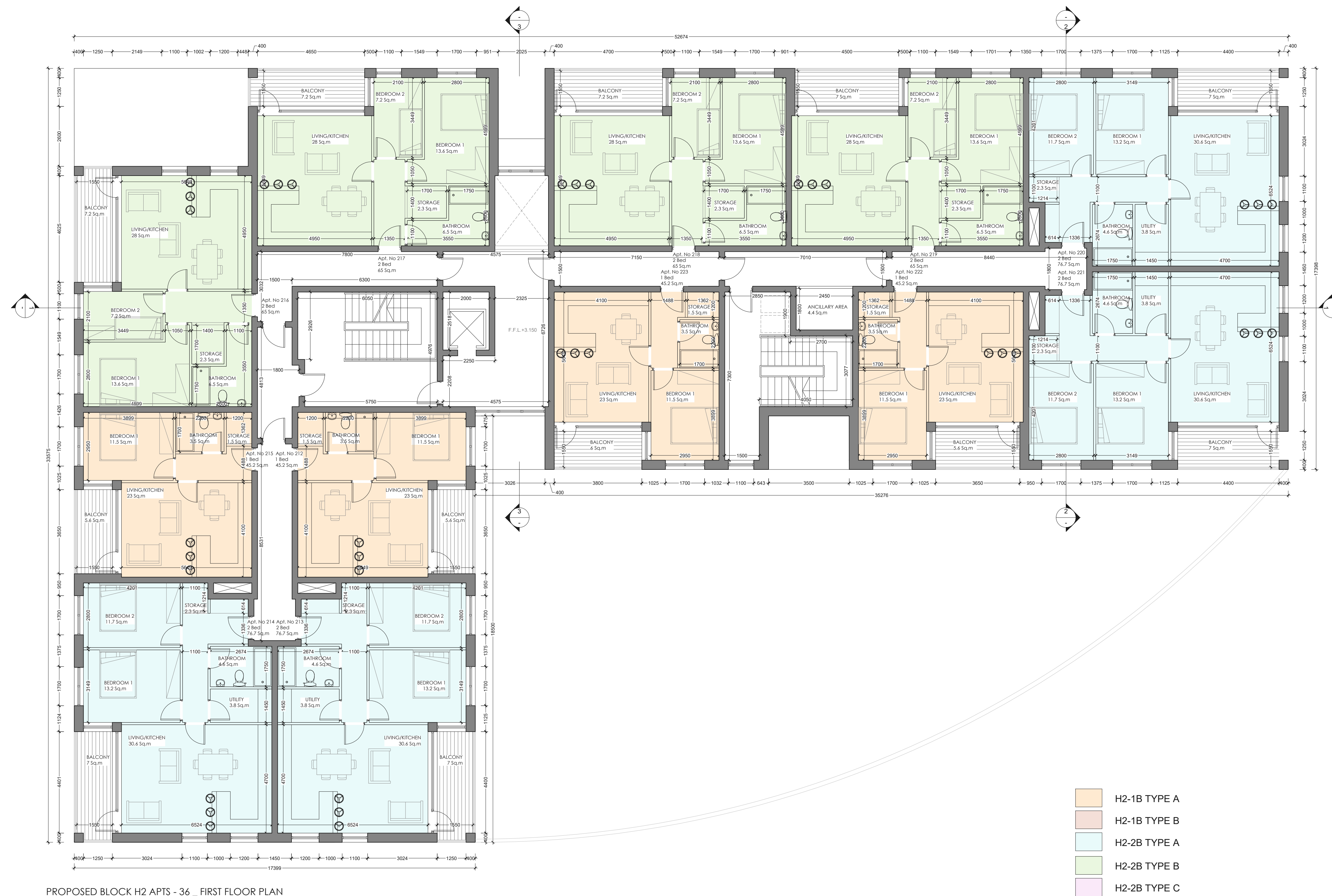
PROPOSED BLOCK H2 APTS - 36 _ FIRST FLOOR PLAN