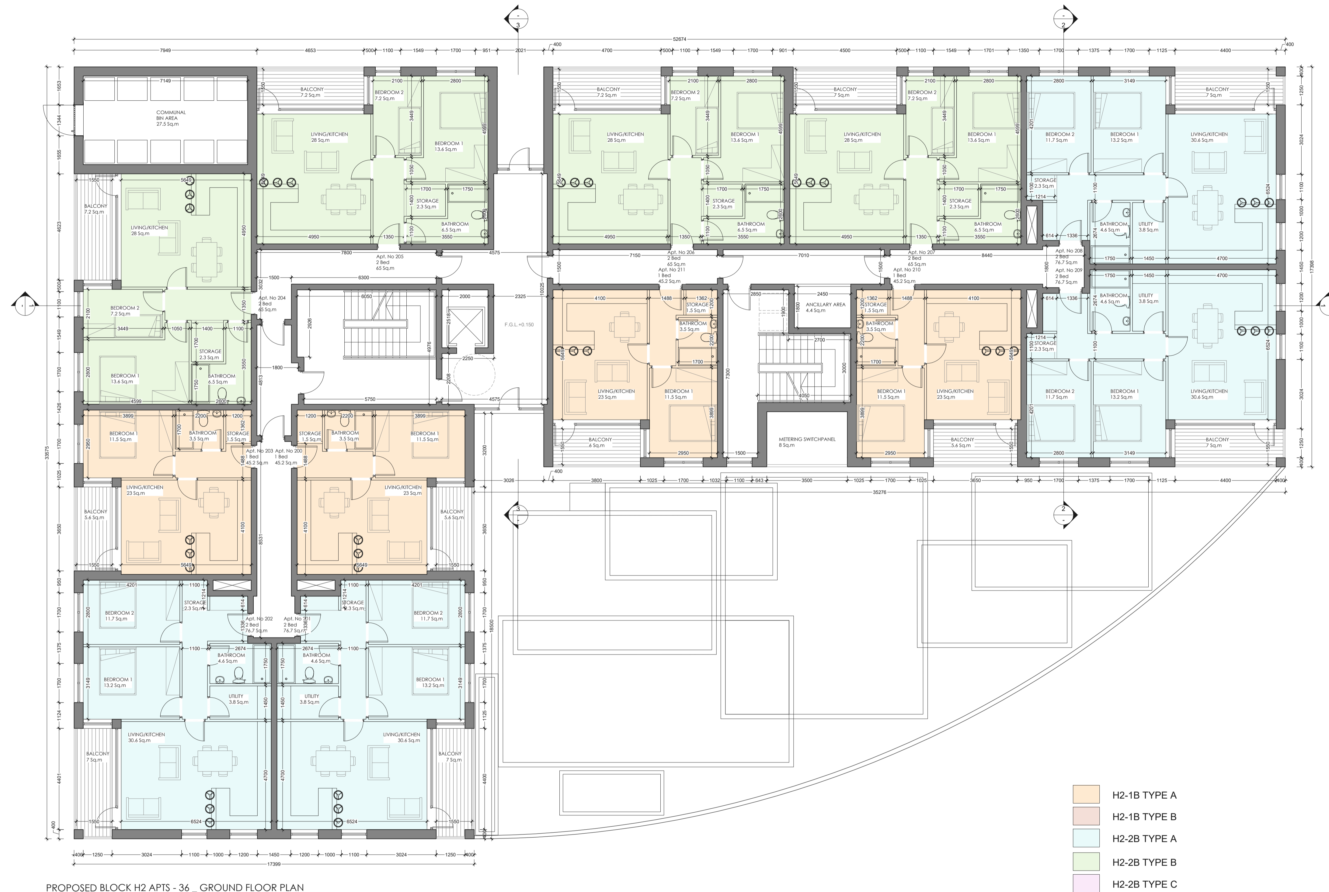
PROPOSED BLOCK H2 APTS - 36 _ GROUND FLOOR PLAN