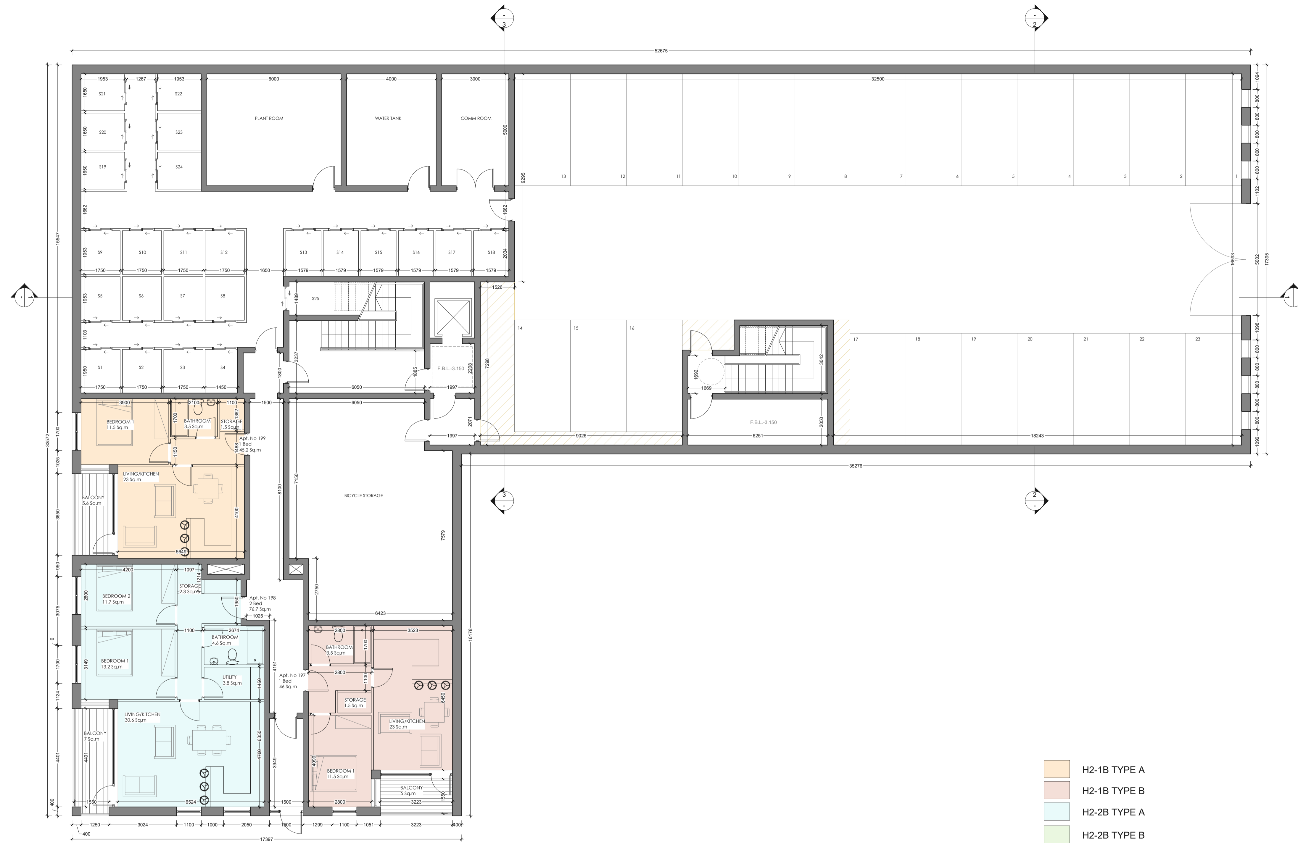
PROPOSED BLOCK H2 APTS - 36 _ SEMI-BASEMENT/ LOWER GROUND FLOOR PLAN