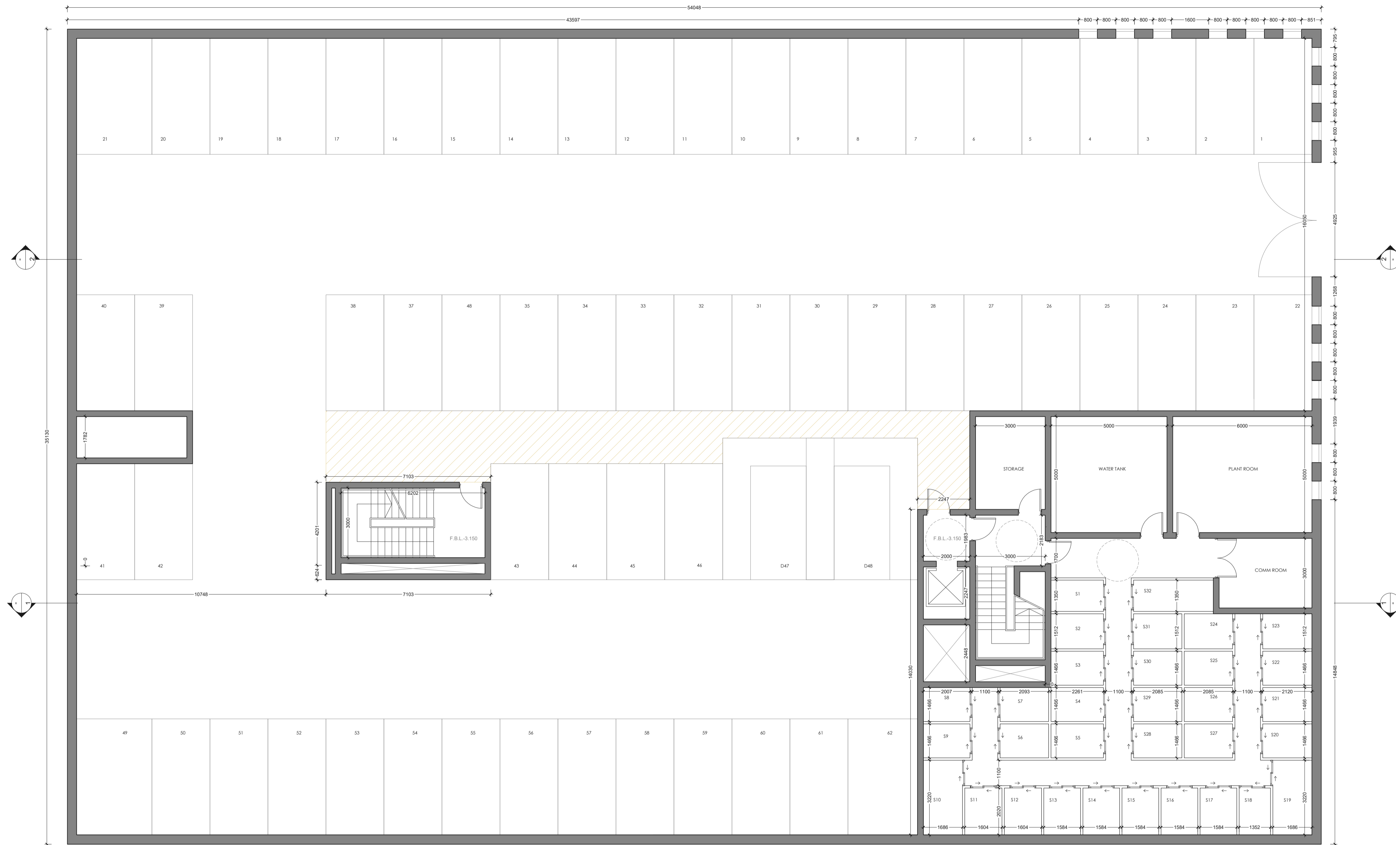
PROPOSED BLOCK H1 APTS - 48 _ BASEMENT PLAN