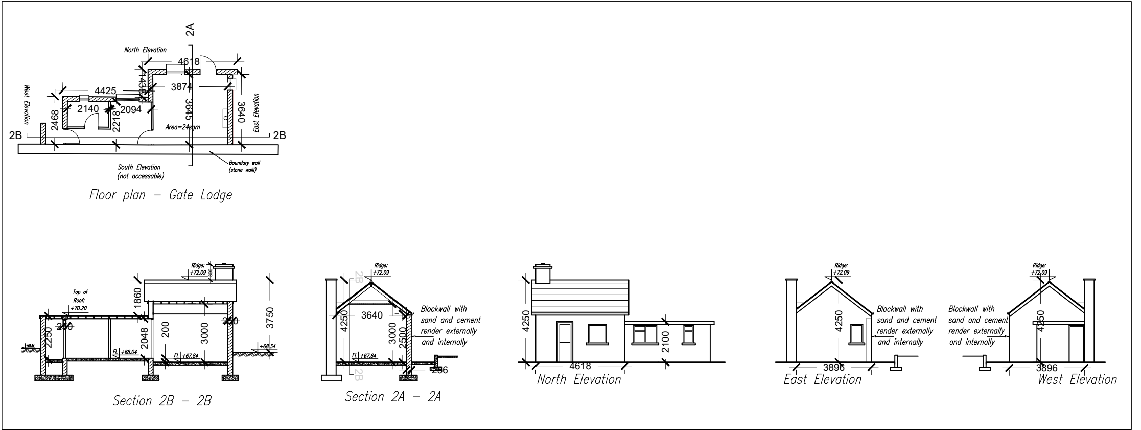
Existing Gate Lodge Scale 1:200 @A3