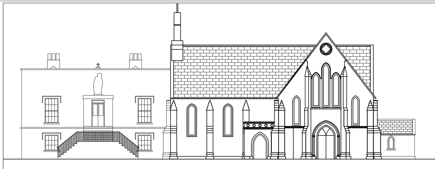
Proposed East Elevation (No Alteration to Existing Protected Structure) Scale 1:200 @A3