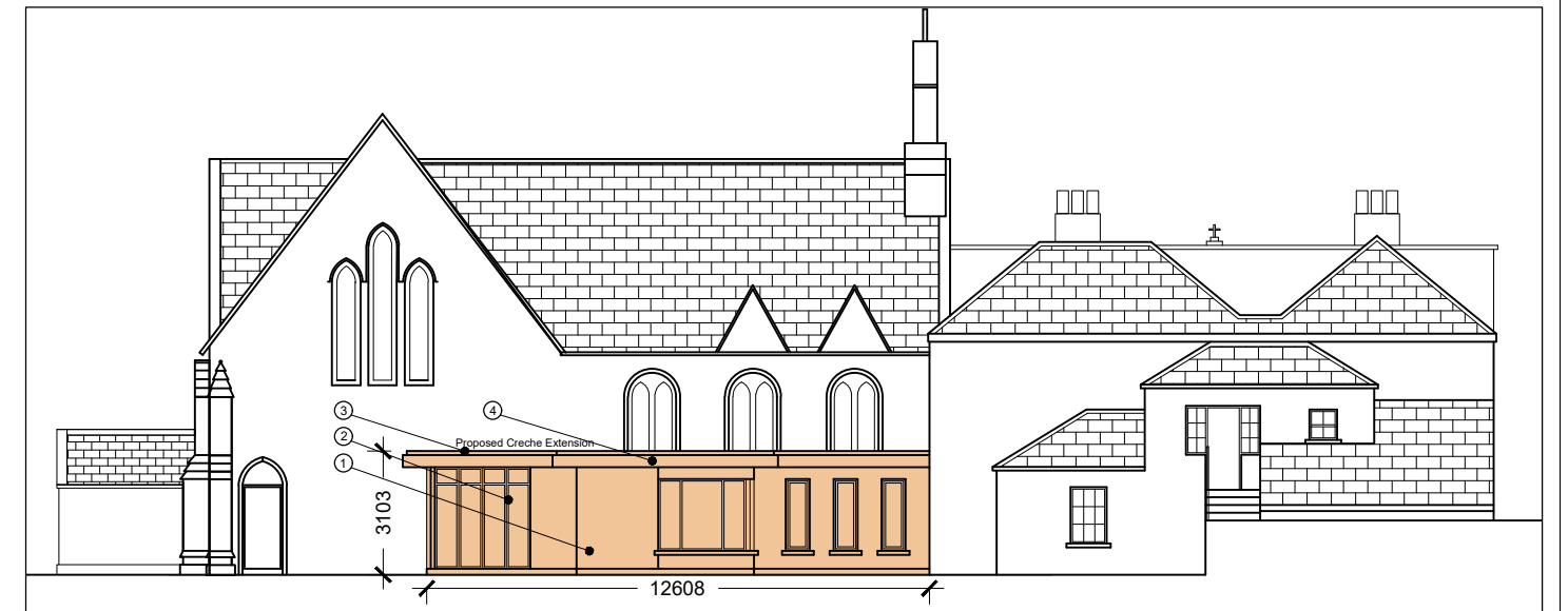
Proposed West Elevation (Proposed Extension Hatched) Scale 1:200 @A3