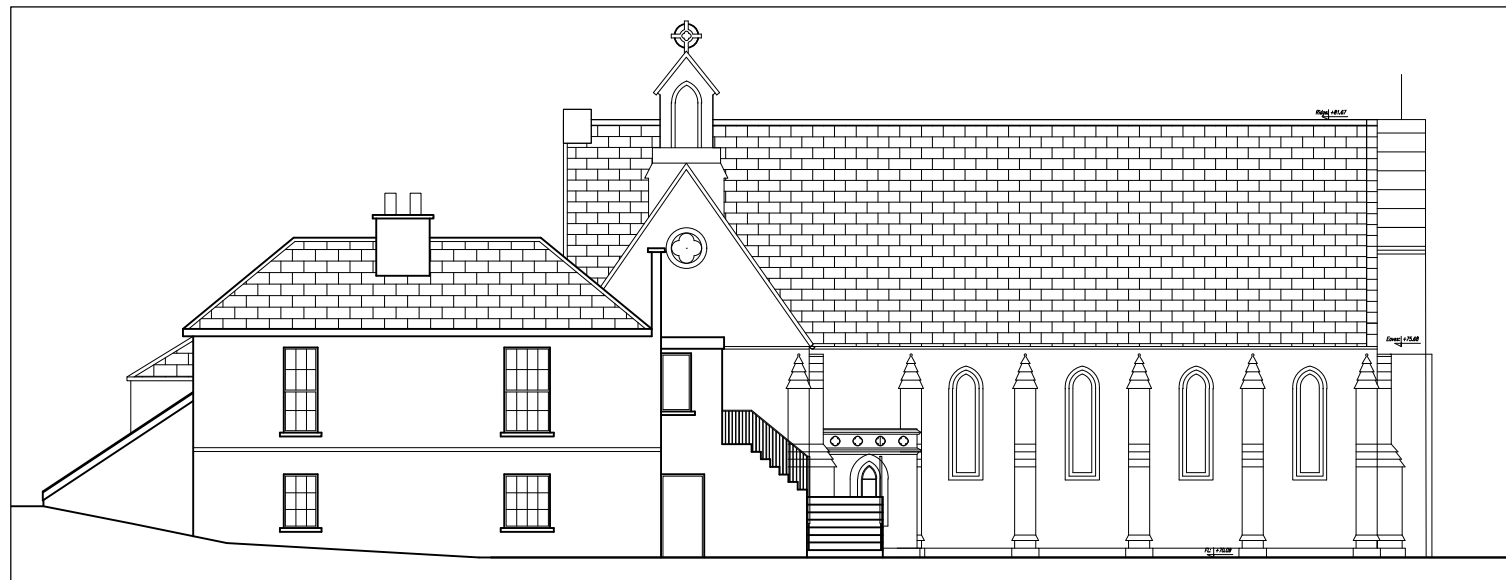
Proposed South Elevation (No Alteration to Existing Protected Structure) Scale 1:200 @A3