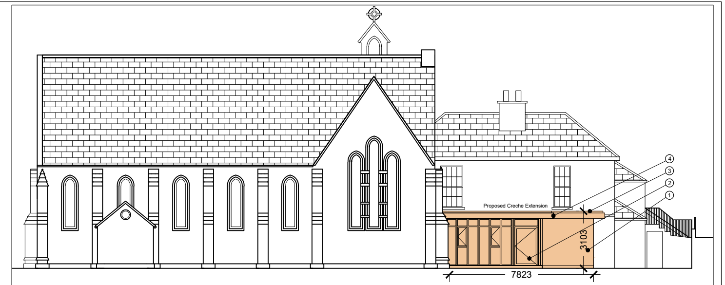
Proposed North Elevation (Proposed Extension Hatched) Scale 1:200 @A3