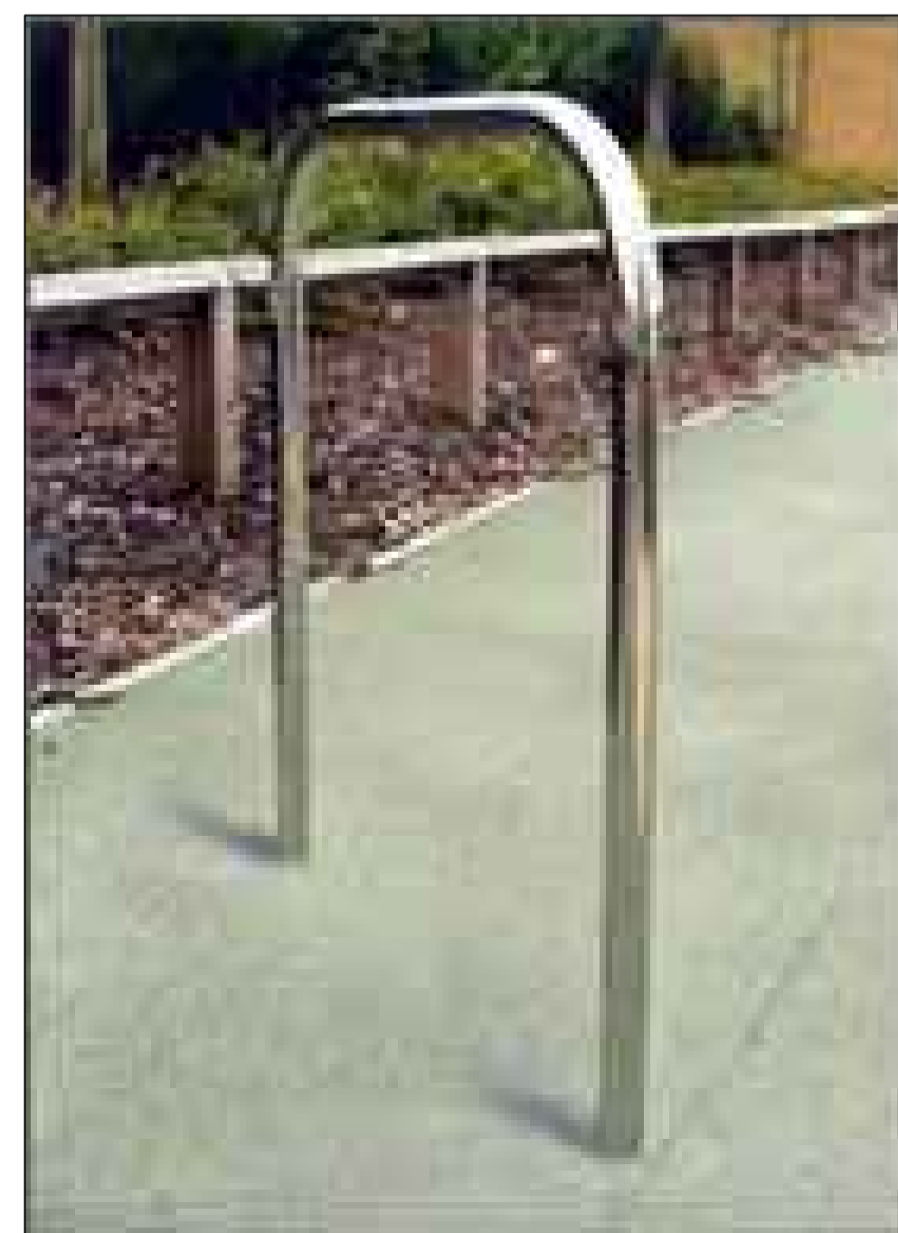
VIEW TO BICYCLE FRAME SUPPORT - REFER TO NATIONAL CYCLE MANUAL 2011