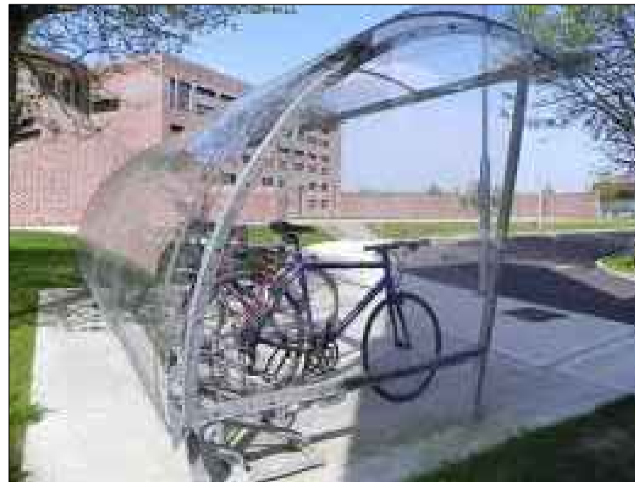
VIEW TO COVERED BICYCLE PARKING AREA